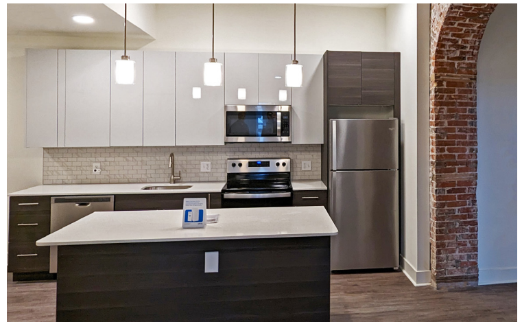
Reuse of structural brick arches bring great character to many of the apartments