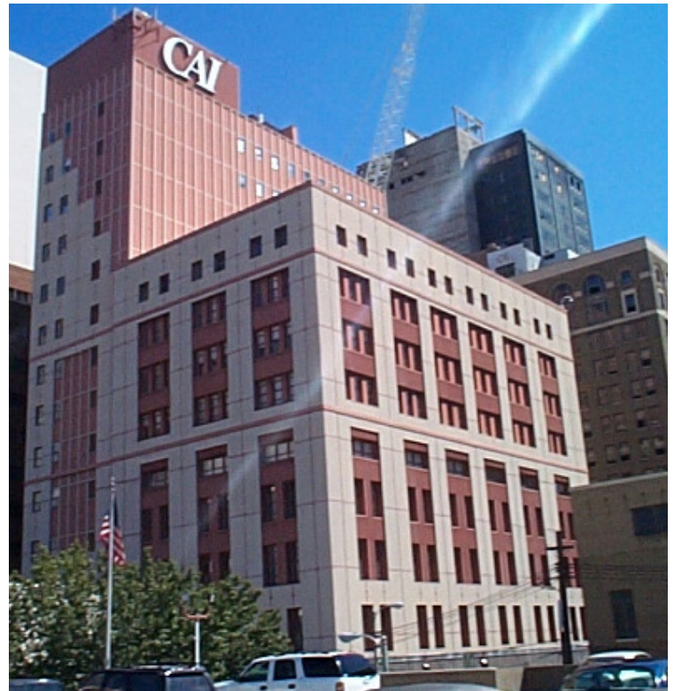
Previous Exterior from the 1980's Renovation

As stated by the owner: “Previously known as “The Equitable Building,” “The Bank of Delaware,” and “Market Tower,” the building that sits on 901 North Market Street has a long and noteworthy history. Built as a six-story, masonry office building in 1892, it had Wilmington’s first elevator and was considered Wilmington’s first “skyscraper.” Eventually reaching nine stories in height due to floor additions in 1902 and 1958, the nineteenth century masonry building on the corner was joined by a 14-story steel framed high-rise tower in the 1950’s, again making it the tallest building in the city at 176 feet tall with 89,000 square feet of floor area. Unfortunately, construction work in 1958 removed the terracotta cornices and detailing from the original building when an effort was made to make both structures “modern”- a typical design approach at that time. When the Westover Companies purchased the property in 2017, the neglected, mostly vacant office tower was in need of repair and a new vision.