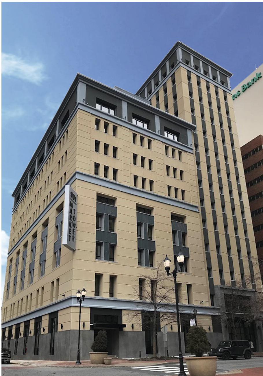
The “NEW” 901 Market Tower from corner of 9th St. and Market St.

Dever Architects Completes Another Successful Adaptive Reuse Project! Congratulations to The Westover Companies on this Iconic Project.