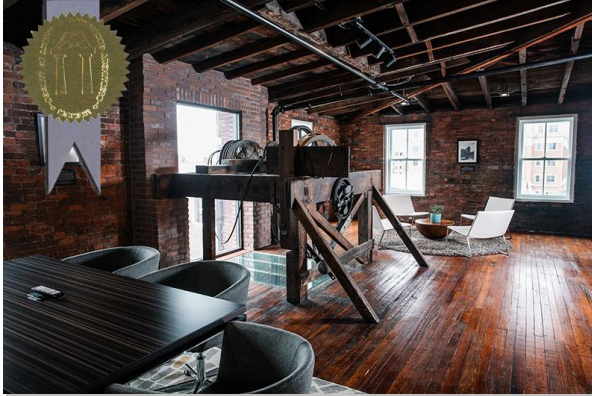
Above: "Synchrony Healthcare"